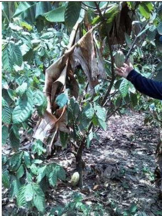
Example of a grafted Cacao plant with pods emerging above and below the graft. Those below the graft share genetic characteristics of the root stock and is not expected to be of equal value.