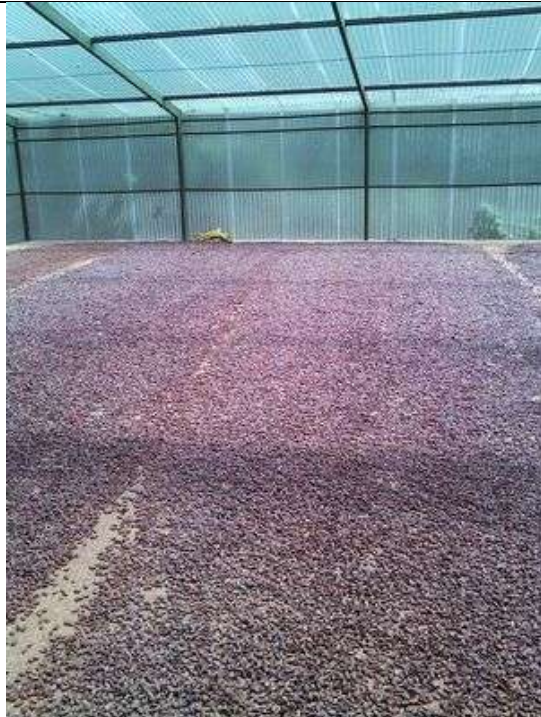
After fermentation the beans are moved to the second floor where they are exposed to high temperatures under a polycarbonate greenhouse