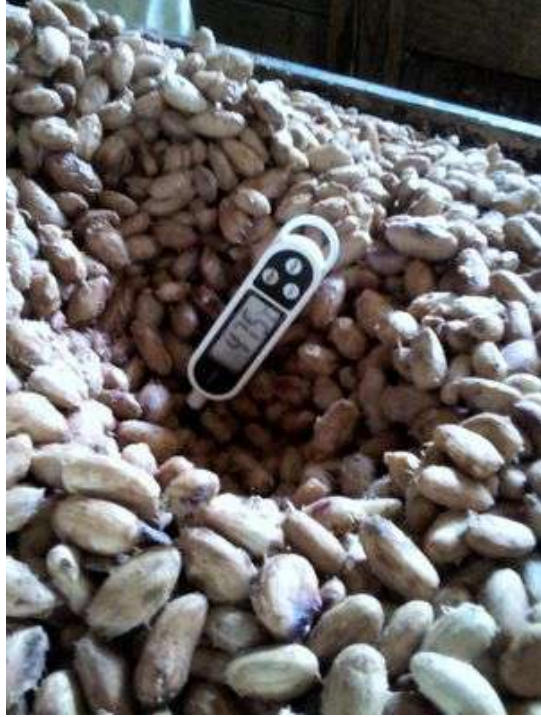
Thermometer used to verify that ideal fermentation temperature has been reached