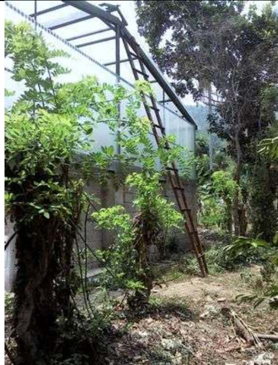
Exterior of new processing facility. The architect estimated completion by May, 2016.