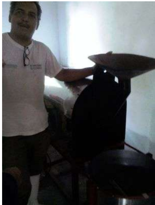
The dried beans are roasted in this small, rotating oven. At current levels of production the roasting, grinding and packaging operation runs once every two weeks. This could be scaled up as market conditions permit.