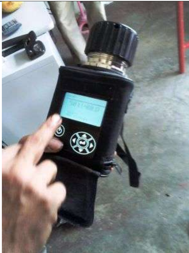
This device is used to measure the humidity of beans. This batch had reached 9% humidity, but the target is 7%.