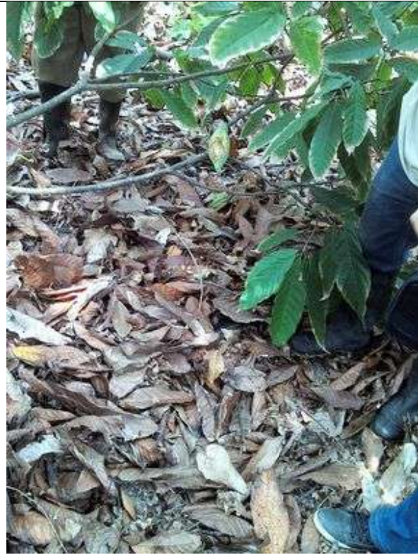
The cacao pod in the center of this photo has been gutted by a squirrel (ardilla). When production is lower, pests take a higher percentage of what remains.