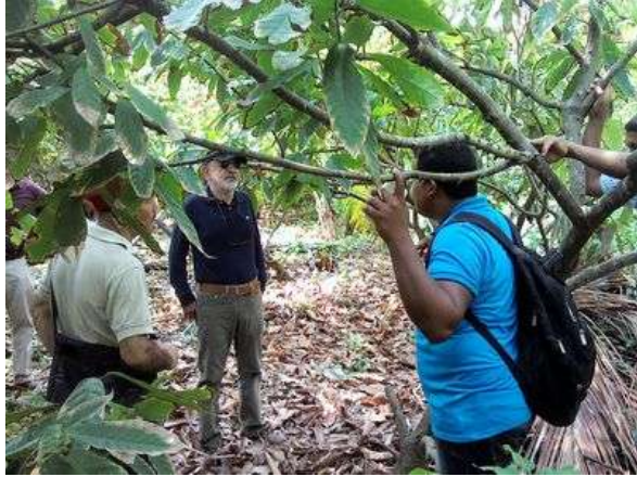
The facility director (blue shirt) took us to a nearby cacao producer. The shortage of rain has been the biggest challenge, particularly in hot, coastal locations.