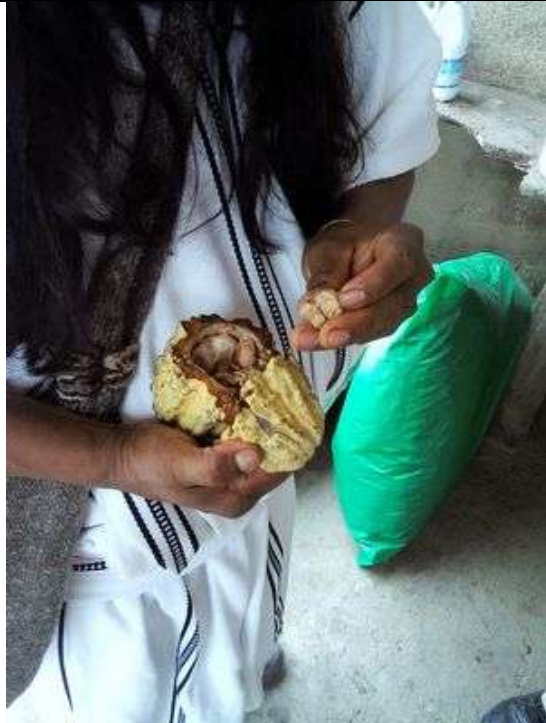
The manager demonstrates the unique features of the white or Porcelana Cacao.