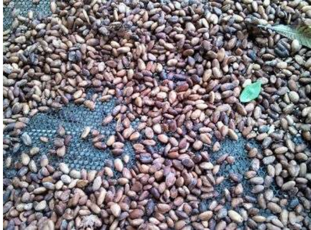
Drying is carried out in open air trays. The trays are constructed of wood with plastic mesh on the bottom.