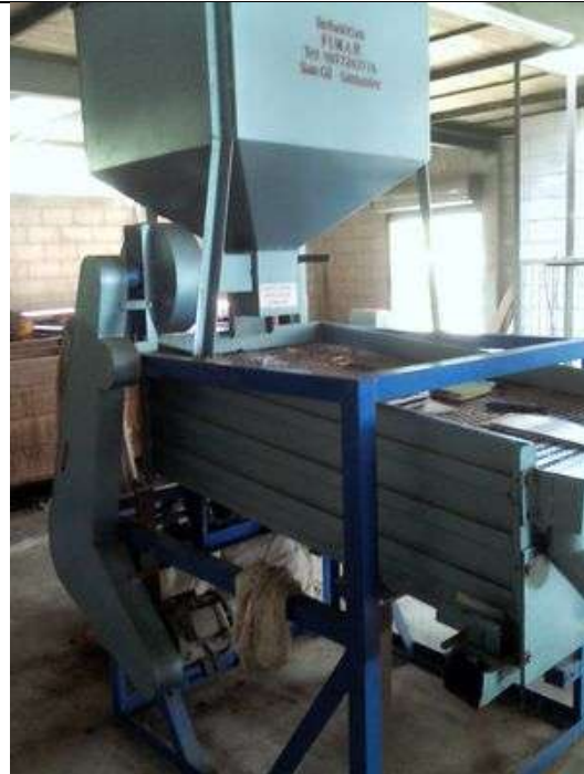
The dried beans are sold, or can be further processed. The next step is to remove a thin outer-shell using a peeler/sheller/winner. Additional hand cleaning is also required.