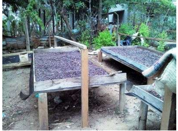
This facility does not have a polycarbonate roof. Rain is less frequent in Mingueo. When it rains they staff cover the trays with plastic tarps or move them under a roof.