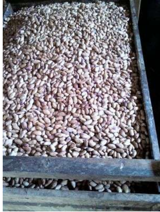
At the end of the Fermentation Process the outer fruit layer has dried, with some of the content absorbed into the bean.