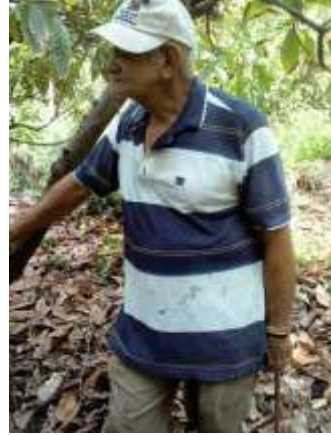
The farmer described some of the challenges he has faced. He is interested in using irrigation on this land, but either has not had the funds for pumps, pipes and electricity or hasn't felt these would result in sufficient increases in production.